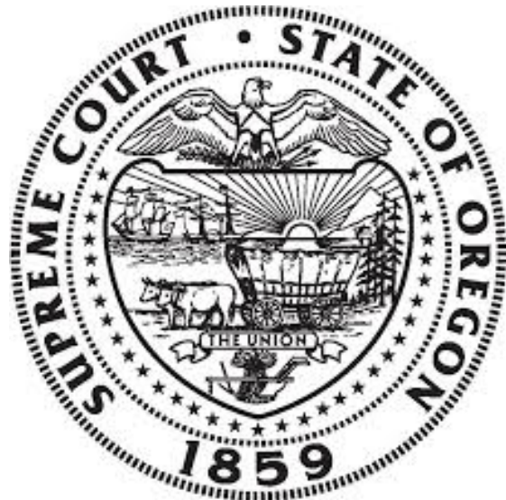
Close up view of the Oregon Seal which is on the state flag.