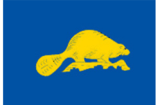
Detail of reverse side of flag